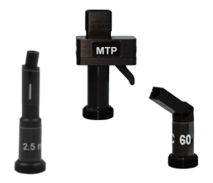
Interchangeable adapter tips provide inspection of many different connector types.