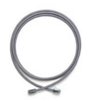
G10FP Patch Cord