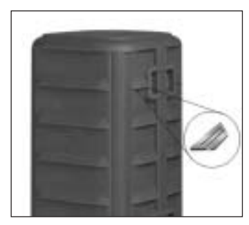
A08 – 600 Series Cover with Anti-Insect Vents