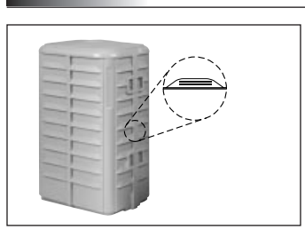
A08 – 600 Series Cover with Anti-insect Vents