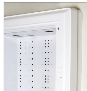
P3000 with 2 Frame Extenders stacked