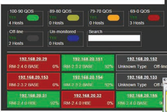
Enterprise QoS overview