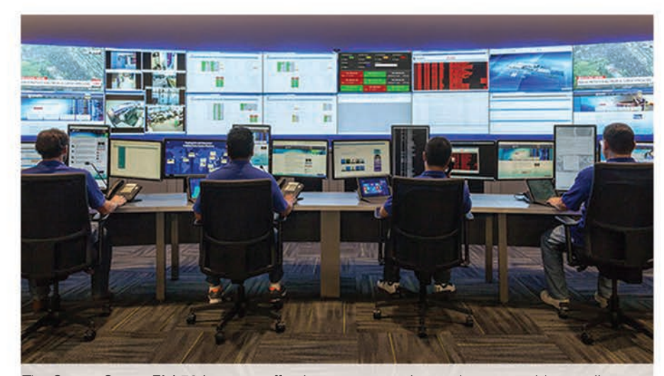
The StreamScope EM-50 is a cost-effective way to monitor and manage video quality and regulatory compliance across your DTV network.

As part of your network control center, the EM-50 enables engineers and managers to configure alerts, email notices, and report subscriptions. As your DTV services expand, it's easy to add remote monitors and configure them from one central location. For video management on the go, the EM-50 user interface can be viewed on mobile devices.