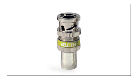
179DTBHDL 179 Digital Truck BNC with Locking Connector