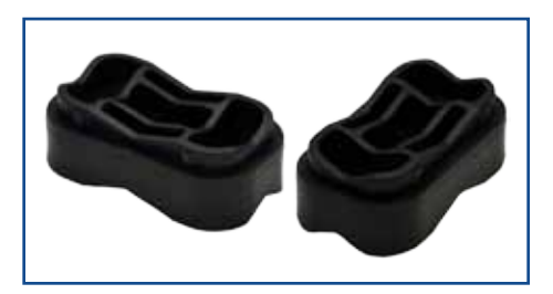
Modular, Stackable Cable Spacers