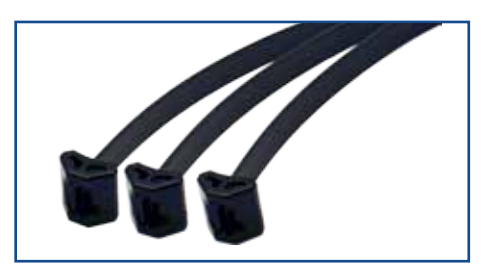
Diamond®-Tek Cable Support Straps with Locking Head