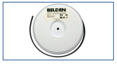
Diamond®-Tek 50' Cable Support Strap Reel