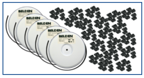
Diamond®-Tek Cable Support Strap Kits