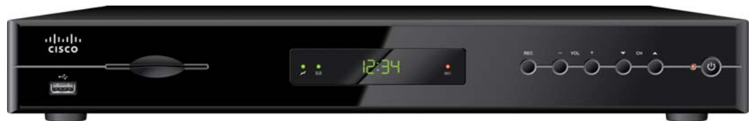
Figure 1. Cisco 8485DVB MPEG-4 HD DVR (image may vary from actual product and specification)

The 8485DVB is compliant with DVB-C standards, MPEG-2 and MPEG-4 standards, supports PAL video formats, and is designed to be compliant with the required safety, emissions, and immunity specifications (as per the mandatory laws that may be applicable to Cisco). With its SmartCARD reader, it is built to support renewable security.