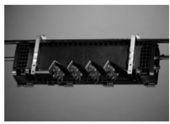
OptiSheath Advantage Aerial Terminal, (SCA-6T24) back | Photo SHD164