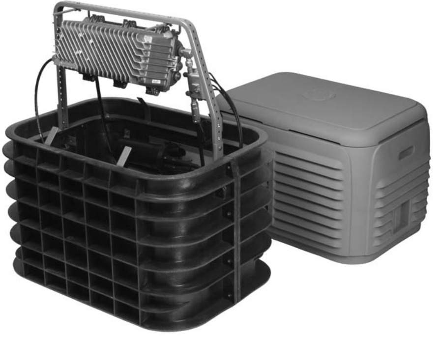
SPH2436 500 Series Signature Pedestal Housing