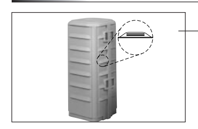
A08-600 Series Cover with Anti-insect Vents